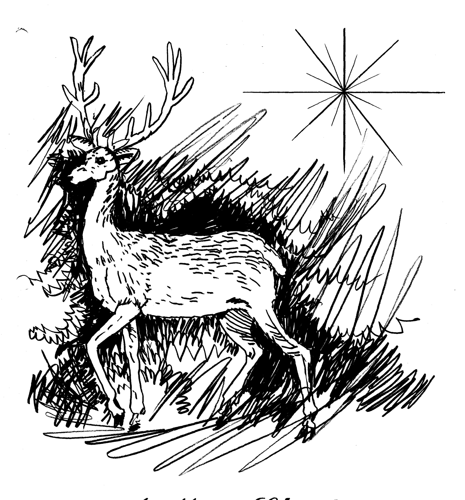
A Merry Christmas and A Happy New Year